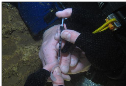
Figure 4. Tagging with Visible Implant Elastomer.