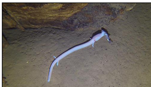
Figure 3. The olm Proteus anguinus eating a Common minnow.

The common minnow Phoxinus phoxinus inhabits the cave entrances especially during dry periods, but can also be seen in deeper parts of the caves. During a monitoring dive in 2016 we witnessed an olm eating a common minnow (Fig. 3.). We did not witness the actual hunting and catching, but as the fish looked intact and fresh we can assume that it was actively caught while still alive. This observation shows that the surface dwelling common minnow or other small-sized fish can at least occasionally play an important role in the diet of olms (Lewarne & Balázs 2016).