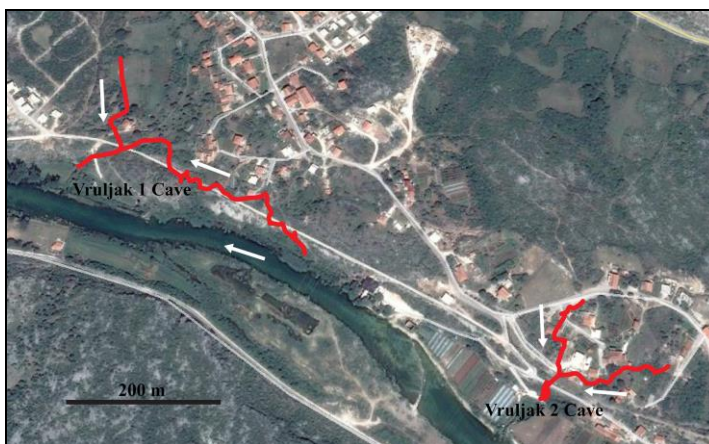
Figure 1. Positions of the Vruljak 1 Cave and Vruljak 2 Cave in Trebinje, Gorica District. The white arrows represent flow directions.

The accessible lower end of the Vruljak System (Vruljak 1 Cave and Vruljak 2 Cave) is situated right under the edge of the city on the right side of the Trebišnjica River and has side passages that are most probably directly connected with the surface and are, therefore, vulnerable to anthropogenic influence (Fig. 1.). To prove such information, the traditional field method is dye testing, which gives precise data on the source locations and also provides some information on the nature of the connecting passages. Dye testing needs a lot of manpower, special conditions and perfect timing. In the case of a complex system, the results can be largely affected by the chosen water conditions and therefore can only be interpreted according to those water conditions. To gain long term information, we installed water temperature loggers (Tinytag Aquatic 2 by Omni Instruments) in various but well defined passages. A one-year long trial with a sampling frequency of