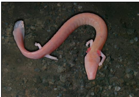
Figure 1. The olm in Hermann's Cave.

Since 1931, live individuals of Proteus anguinus , the proteus or olm (Fig. 1), have been kept in an artificial environment in the show cave Hermannshöhle (Hermann's Cave) in Rübeland, Harz Mountains, Sachsen-Anhalt, Germany. In 1956, more animals were brought to Rübeland. Originally all animals came from the Postojnska jama and were brought unlawfully to Rübeland (Völker 1981). A total of 20 animals were taken to Rübeland over a period of 25 years (Knolle et al. 2016). In 2015, almost 60 years after the last animal had been put into the artificial lake in the cave, nine of the animals were still alive.